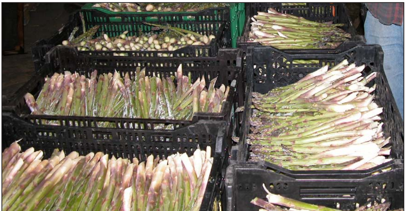
Scout fields for asparagus beetle and apply insecticides applications if they reach the thresholds described above.