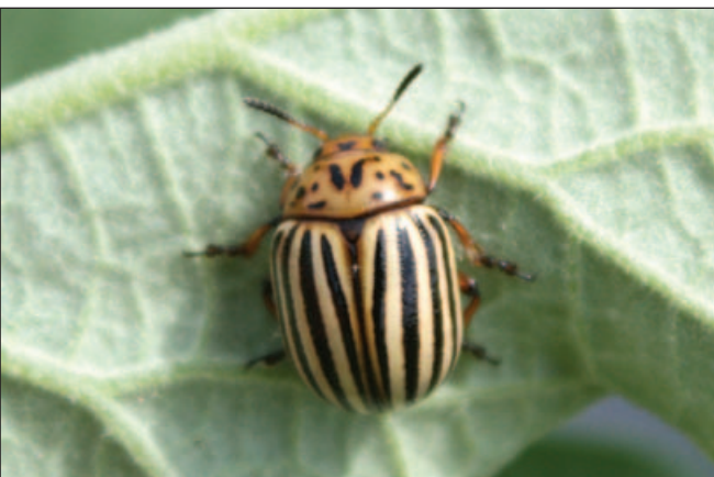
Figure 9. Colorado potato beetles can be a pest in many crops, including eggplant. See pages 96-97 for management options.