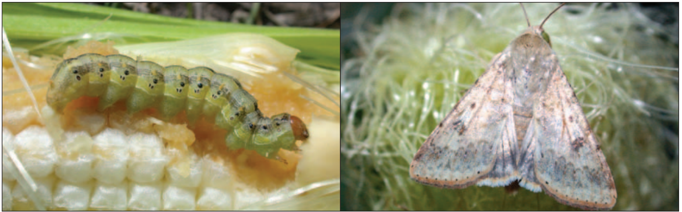
Figure 11. Corn earworm larva (left) can be a significant sweet corn pest. The adult (right) is shown for identification purposes. See page 156-157 for management options.