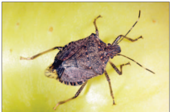
Figure 10. The brown marmorated stink bug is an emerging pest in the Midwest. If you see this pest, contact your state extension specialist. More information is available from Purdue Extension at extension.entm.purdue.edu/caps/pestInfo/brownStinkBug.htm .