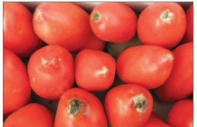
Figure 20. These roma tomatoes suffer from varying degrees of blossom end rot. See page 89 for management options.