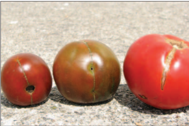
Figure 17. Zipper scars on tomatoes. See page 88 for more information.