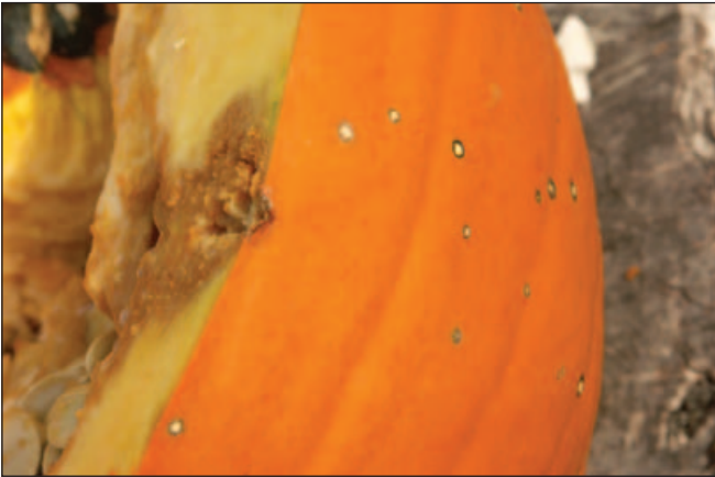
Figure 2. Bacterial spot lesions on pumpkin are light colored with water-soaked margins. The cut open pumpkin shown here has a secondarily infected lesion that has rotted through the fruit. See page 76 for management options.