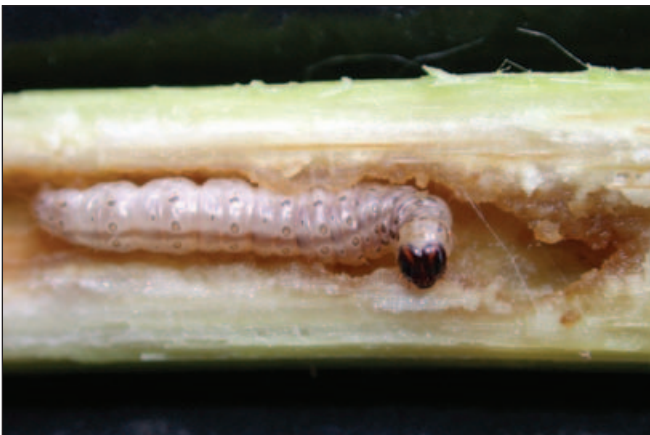
Figure 7. European corn borers can be a problem in peppers. See page 98-99 for management options.