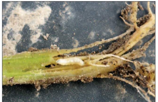
Figure 8. Seedcorn maggots can be a problem in many crops including muskmelon. See page 85 for management options.