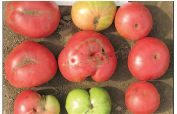
Figure 18. Catfacing on tomato. See page 88 for more information.