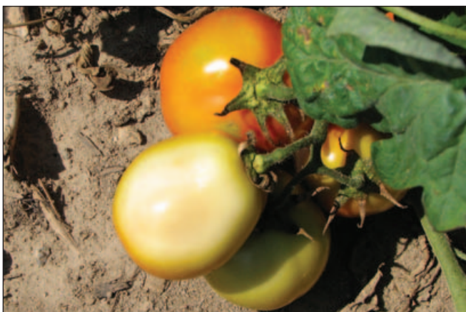
Figure 14. Sunscald appears as a white, hard area on a portion of the tomato fruit. The area may later shrivel and sink in. See page 88 for details.