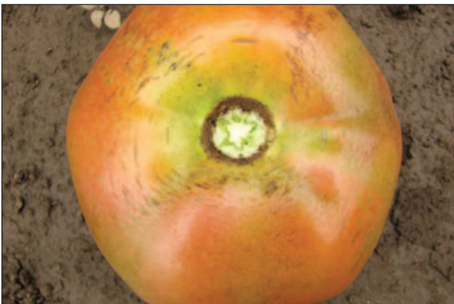
Figure 19. Micro-cracks or rain checks. See page 88 for more information.