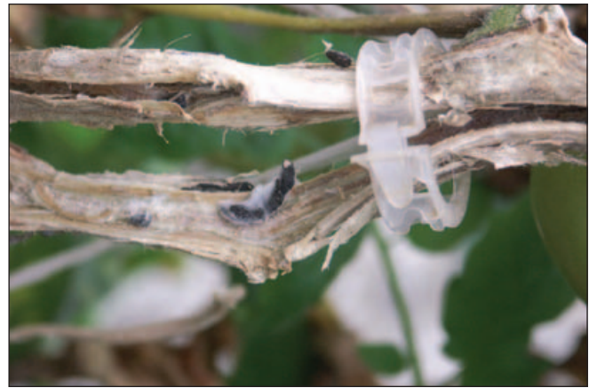
Figure 6. White mold or timber rot of tomato kills stems and entire plants. The black fungal structures (sclerotia) shown here are diagnostic of this disease. See page 93 for management options.