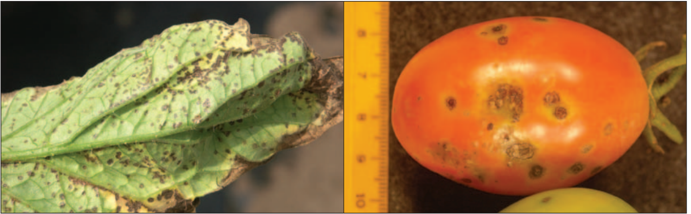
Figure 1. (Left) Bacterial spot of tomato causes small necrotic lesions on leaves that are often accompanied by chlorosis. (Right) Lesions on fruit are often scabby in appearance. See page 89 for management options.