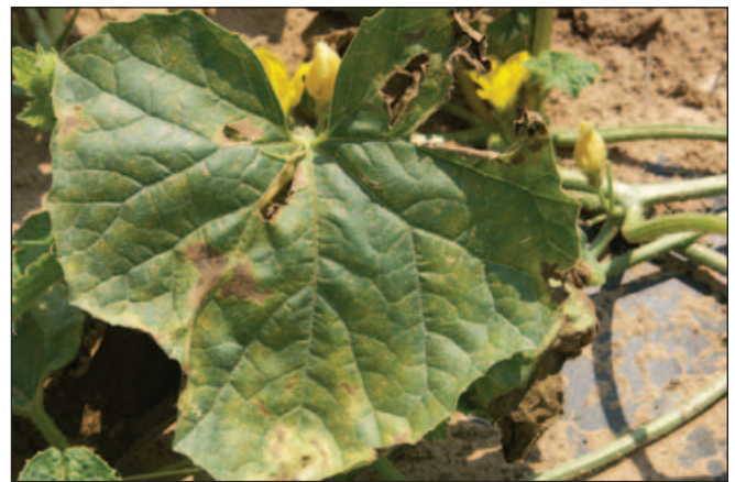
Figure 13. Manganese toxicity on muskmelon is a disorder that can occur if soil pH is too low. See pages 71-72 for soil pH and fertility recommendations for cucumber, muskmelon, and watermelon.