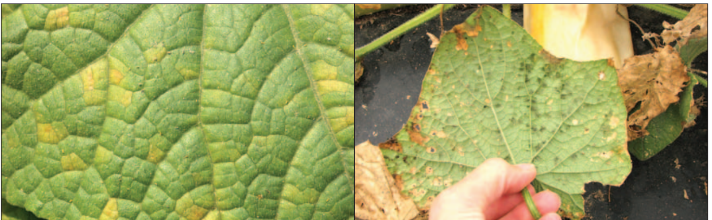
Figure 4. (Left) Downy mildew of cucumber causes angular chlorotic lesions. (Right) During moist conditions, the fungus that causes downy mildew is visible on the undersides of infected leaves. See pages 76-77 for management options.