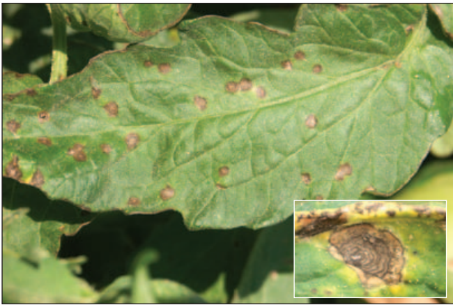
Figure 5. Early blight is one of the most common tomato diseases. The inset shows a close-up of early blight's characteristic bull's-eye lesions. See pages 90-91 for management options.