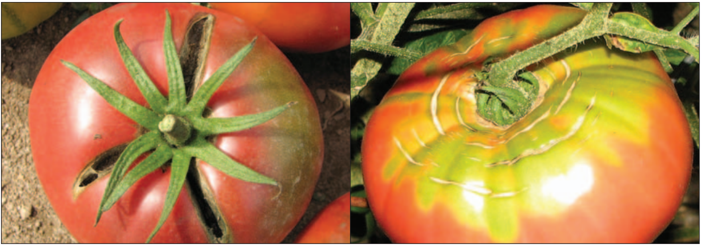
Figure 16. Radial (left) and concentric cracks on tomato. See page 88 for more information.