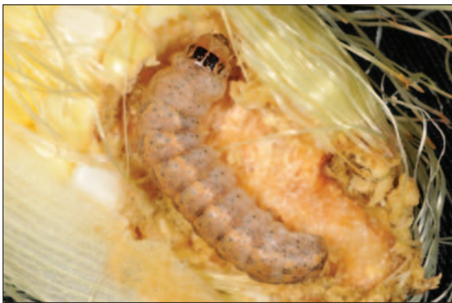
Figure 12. Indiana has confirmed the presence of western bean cutworm and it may be present in other states covered by this guide. It is not clear how much damage this pest causes. If you observe this pest, contact your state extension specialist.