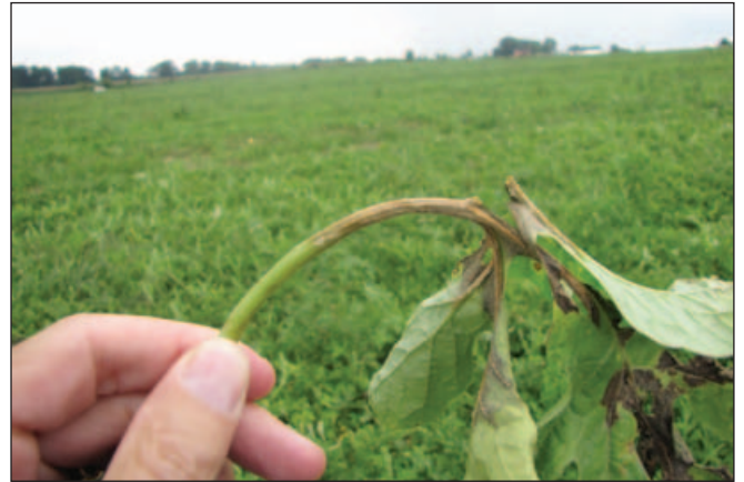
Figure 3. Gummy stem blight on watermelon often turns leaf petioles light brown and produces dark brown, irregular leaf lesions. See page 78 for management options.