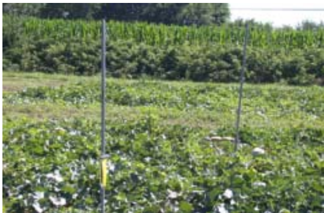
Figure 1. Sticky traps were placed in between rows of muskmelons. A sticky trap was placed vertically (left) with the lower edge even with the top of canopy and another sticky trap was placed horizontally (right) even with the top of canopy.

A field study was conducted at Southwest Purdue Agricultural Center near Vincennes, Indiana in 2003. The experimental design had seven rows, including five center rows for insect scouting and two guard rows. A randomized complete block design with six replications was studied. Muskmelons (variety 'Eclipse') were transplanted to the field on April 28. The densities of cucumber beetles were sampled immediately after the crop transplanted in the field through mid-July. On each sampling date, two yellow sticky traps (Pherocon® AM yellow sticky trap, Trece Inc., Adair, OK) were placed randomly in between the center rows of each replication (Figure 1). One sticky trap was placed vertically with the lower edge even